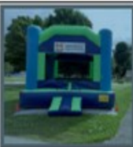
Lime Bounce House