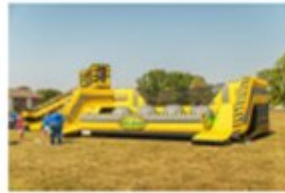
Leaps And Bounds