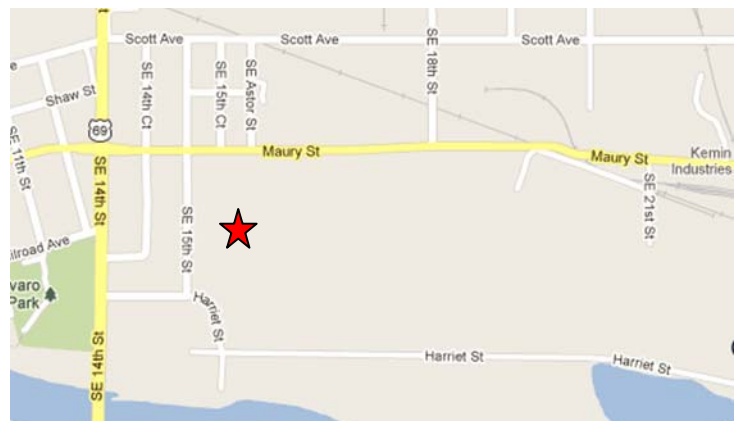
Metro Waste Authority Compost Center , 1601 Harriett St.

Directions: Enter from E 14th ST. to NE Broadway Ave. Turn East on Broadway Ave. to Delaware Ave. Turn south on Delaware Ave. & follow to MWA Transfer Station.