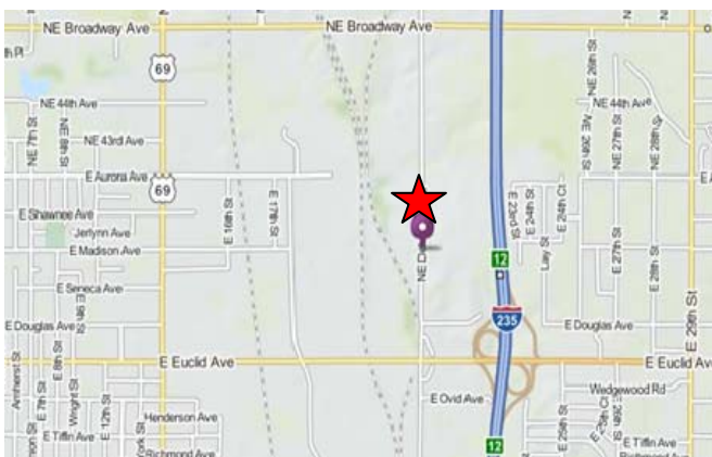
Metro Waste Authority Transfer Station , 4198 Delaware Ave.

Acceptable SCRUB Items for Compost Site: Yard Debris, Yard waste containers, Brush, tree limbs (24" diameter or less; maximum length 10'), prunings Loose leaves, Grass clippings, Straw, hay, and Garden waste.