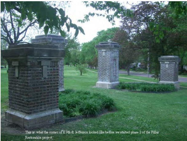
This is what the corner of E 9th & Jefferson looked like before we started phase 2 of the Pillar Restoration project.